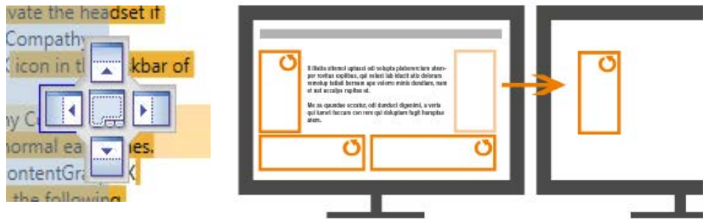
» Docking and repositioning Congree panels

If you do not need a Congree panel temporarily, you can quickly hide it. The Congree integration in JustSystems XMetaL® XMAX also supports flexible detachment, repositioning, and docking of Congree panels in the text editor. Thus, you can organize your panels as you wish, stack them, or even move them to another monitor, e.g. in order to maximize the editing area: